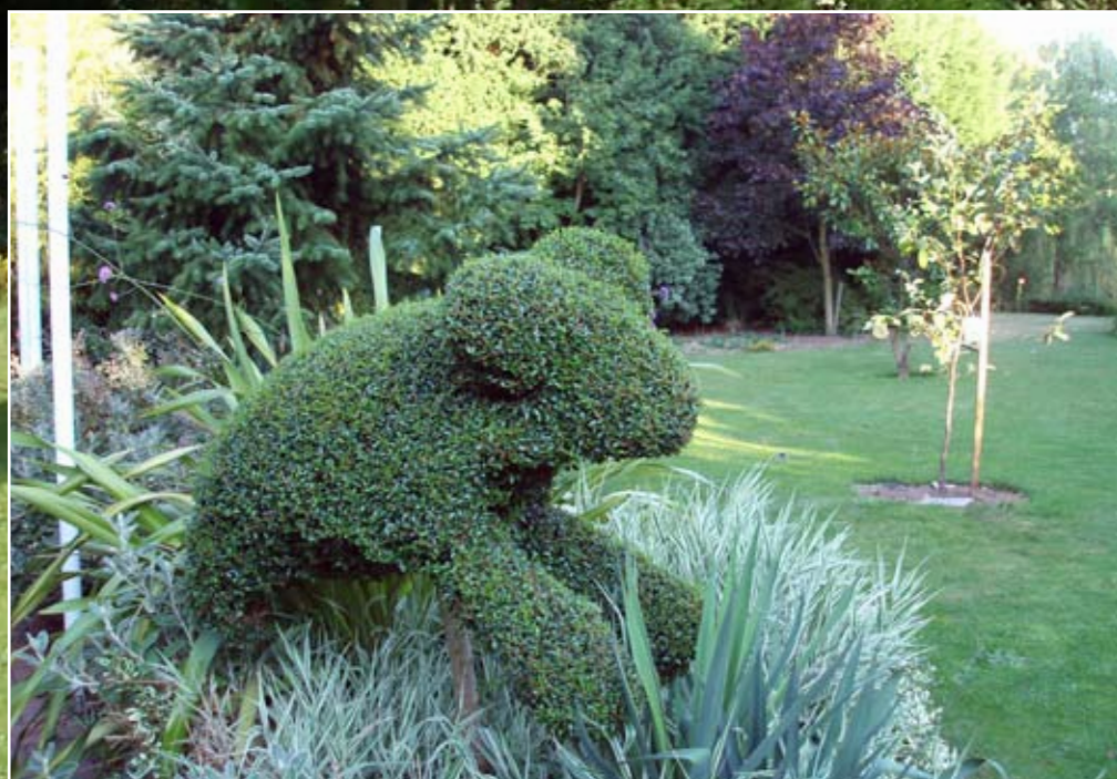
LUCIES FARM LUXURY DOG RESORT